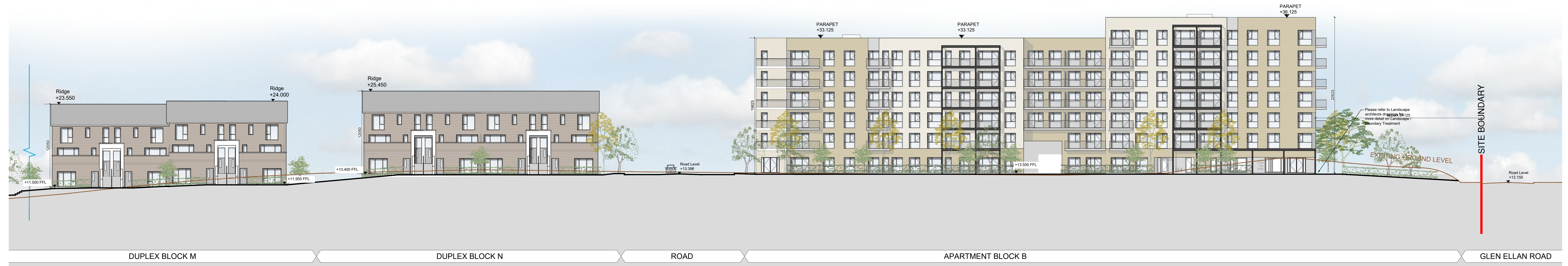
SECTION E-E CONTINUED

NOTES: DO NOT SCALE FROM DRAWINGS WORK TO FIGURED DIMENSIONS ONLY ARCHITECT TO BE NOTIFIED OF ALL DISCREPANCIES.